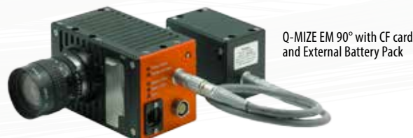
Q-MIZE EM 90° with CF card and External Battery Pack