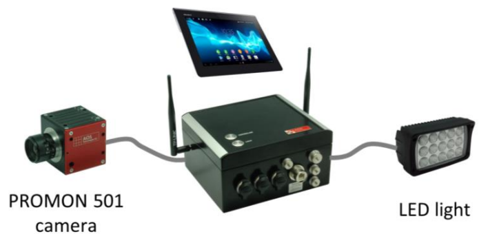
PROMON 501 camera