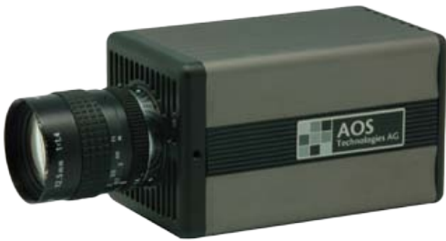
S-PRI high speed camera