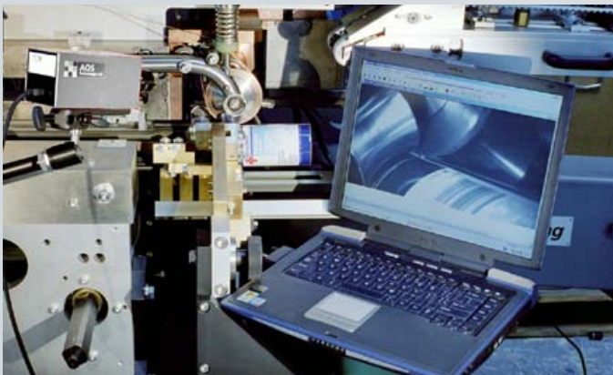
High Speed camera in front of can machine