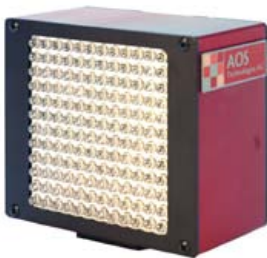
StroboLED light head